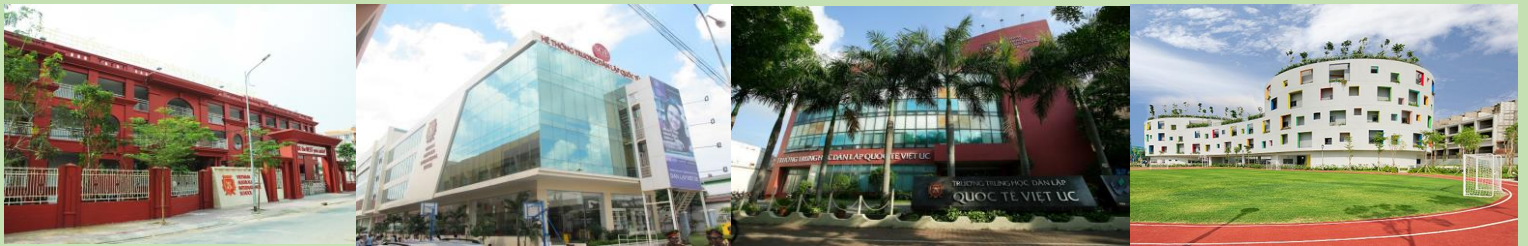
- All VAS's campuses: Sunrise, Hoang Van Thu, Ba Thang Hai, Garden Hills, Sala