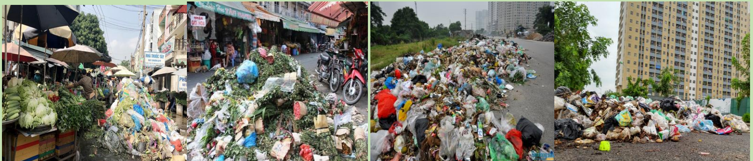
- Market place